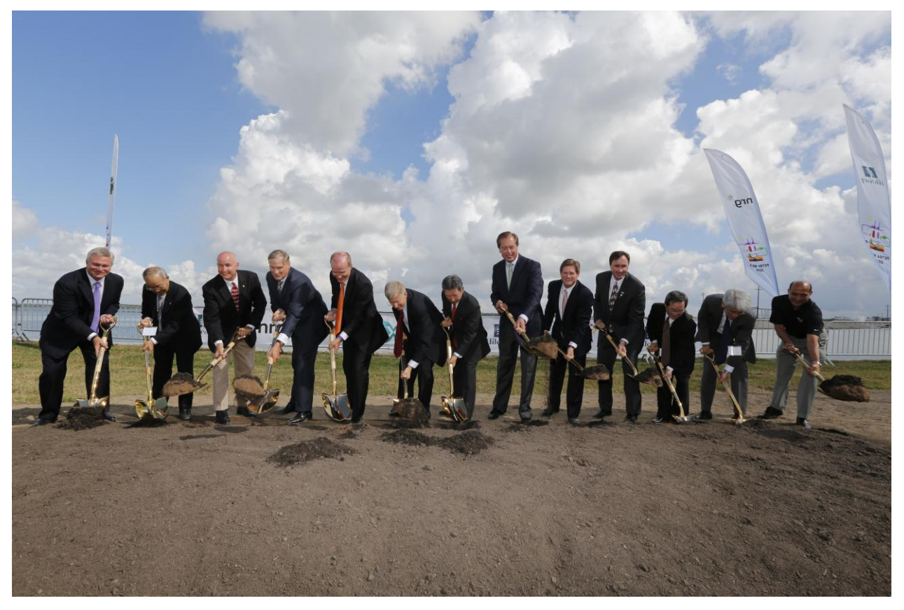
(picture2: a look of groundbreaking ceremony